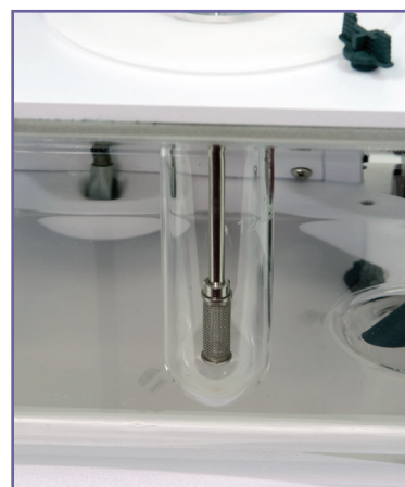
Model 2500 with Small Volume Basket