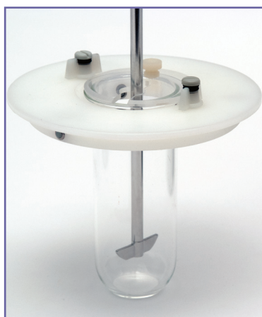
Small Volume Conversion Kit